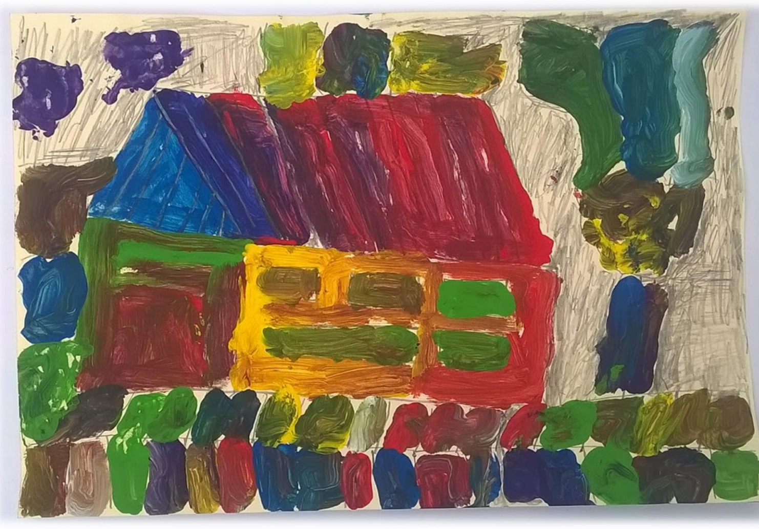
Figure 2. A painting made during a training session