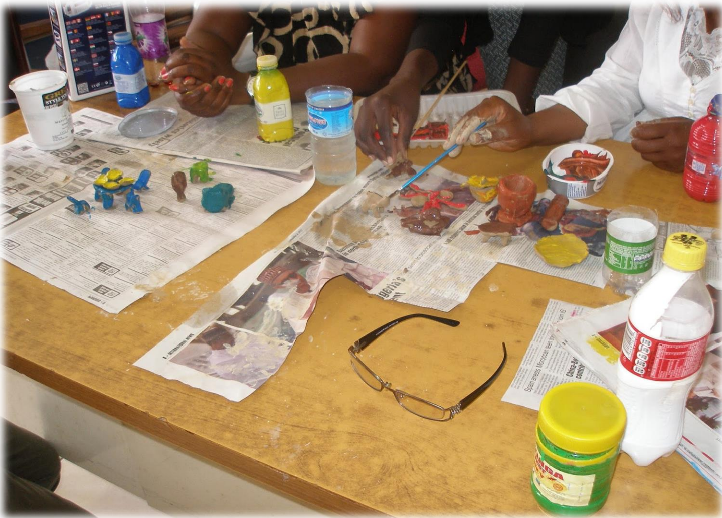
Figure 1. Making art work during a training session