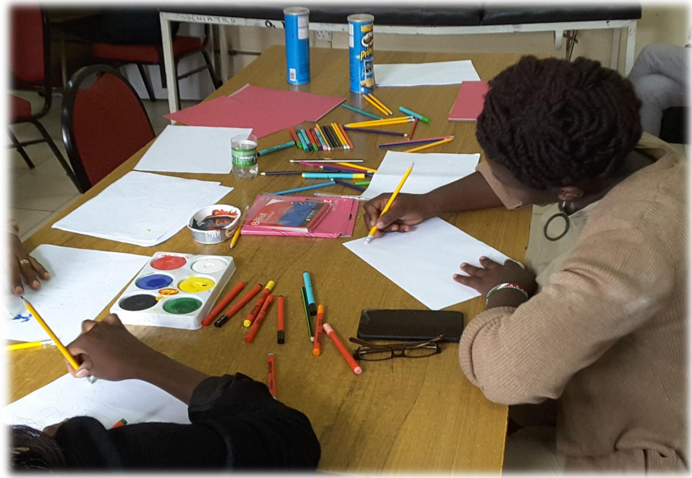
Figure 4. A training session in progress