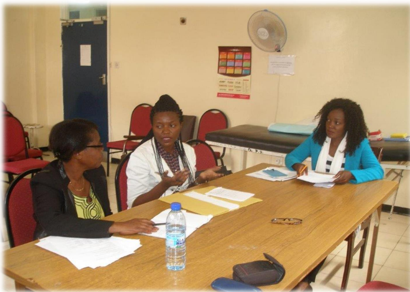
Figure 3. Three of our Zambian trainers